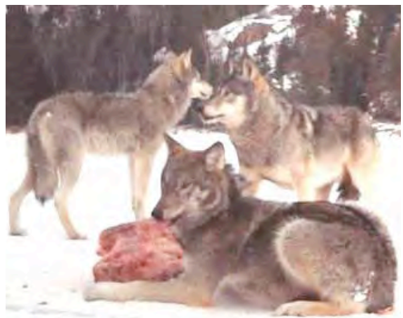
Above pictures of a deer kill were taken in January by Dean Goodmanson of North East Bay