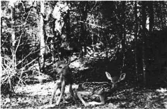
Two newly born fawns spotted on May 19 at Hink's cottage on sunrise Trail. They were learning to walk as they kept falling.

It appears we have extra road side garbage, perhaps some of it left by construction workers in the area this past summer. There has been garbage left outside of the garbage bin or placed improperly in the recycle containers. A reminder to any cottage owners who are having work done on their places or who are renting out to please make sure to explain to workers and renters about the function of the blue recycle containers [no glass or garbage] and where they may find a key to the garbage bin in order to dispose of their "tagged" garbage bags. Have a warm winter and we will see you in the spring.