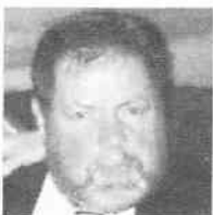
Glen Foster Horseshoe Tournament